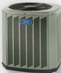
Silver XI American Standard 14

Built to perform and built to last, Silver Series heat pumps provide serious value and uphold American Standard's commitment to quality.