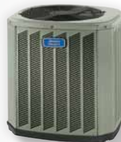
Silver SI American Standard 13