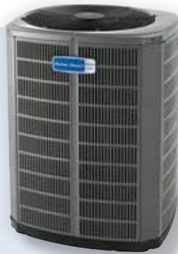
Platinum ZM Heritage® 20

Our most efficient and powerful heat pumps. Enjoy the highest level of comfort and maximum efficiency with features like dual or multi-stage Duration™ compressors and Spine Fin™ coils.