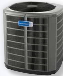
Platinum XM Heritage® 16