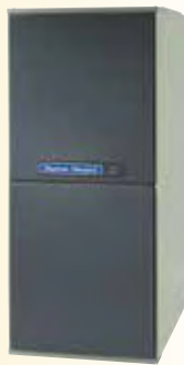
Gold XM 95 High Efficiency Two-Stage