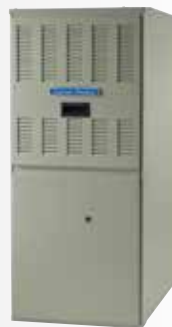
Silver SI 90 Single-Stage