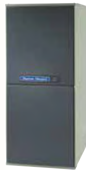
Gold XI 95 High Efficiency Single-Stage