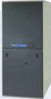
Platinum ZV 95 Comfort-R™ Variable-Speed, Modulating, Communicating

Our most efficient and powerful gas furnace just might be our most comfortable too. With AccuLink™ communicating capability, continuous Comfort-R™ mode and an array of other innovative features, the Platinum Series gives your home maximum efficiency with controlled comfort.