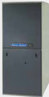
Silver ZI 95 Single-Stage

Designed with value in mind, the Silver Series provides you with the comfort you want, the efficiency and durability you need and, of course, the American Standard commitment to quality you expect.