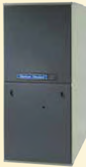
Gold ZM 95 Comfort-R™ Variable-Speed

High quality and high efficiency mean a high standard of comfort for your home. The Gold Series offers just that. Whether you choose variable-speed technology, or a single-stage offering with the power to increase your overall system efficiency, you can be sure that each one contains American Standard's quality craftsmanship.