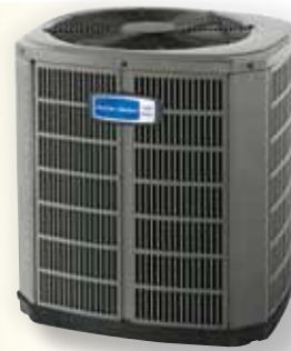
Gold SI Allegiance® 13