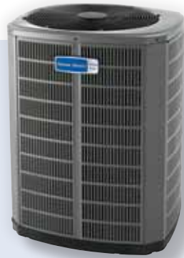
Platinum ZM Allegiance® 20

American Standard Platinum air conditioners offer our highest combination of performance and efficiency. Built with American Standard's commitment to quality throughout, the Platinum line offers advanced energy-saving features like two-stage compressors and Spine Fin™ coils.