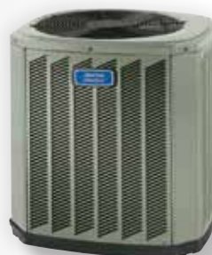
Silver SI American Standard 13