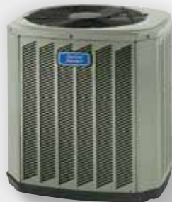
Silver XI American Standard 14

An unbeatable combination of value and reliability, Silver Series air conditioners provide powerful cooling with the reliability you expect from American Standard.