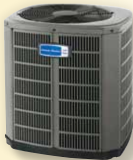
Gold XI Allegiance® 15

Gold Series air conditioners feature proprietary Spine Fin™ coils and Duration™ compressors, and efficiency that keeps you energy smart and comfortable in even the hottest weather.